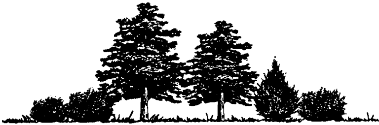
Figure 2: Ladder fuels enable fire to travel from the ground surface into shrubs and then into the tree canopy.

variety of textures and color and help reduce soil erosion. Consider ground cover plants for areas where access for mowing or other maintenance is difficult, on steep slopes and on hot, dry exposures.